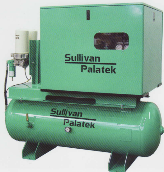
OPTIONAL CDDE MODEL SHOWN